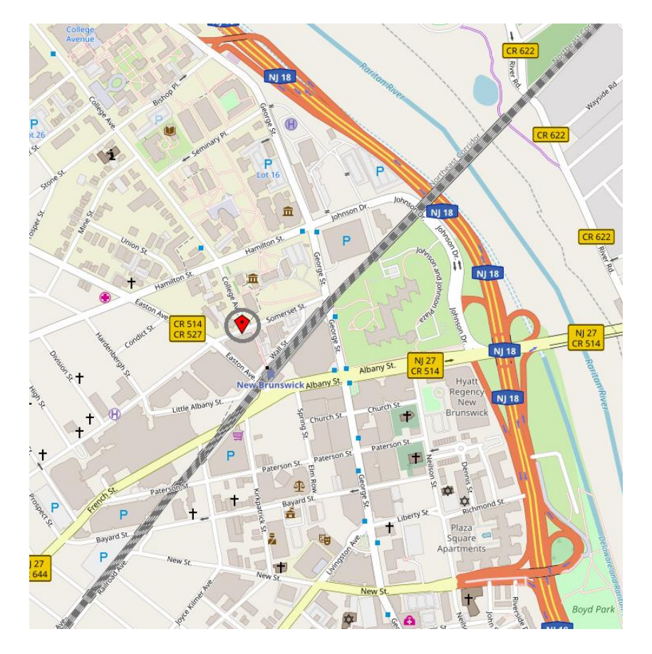
(very close to the New Brunswick station). Please look up the map: http://www.philosophy.rutgers.edu/76-general/directions/732-map

Rutgers University 106 Somerset Street Philosophy Department, Floor 5 New Brunswick, NJ 08827